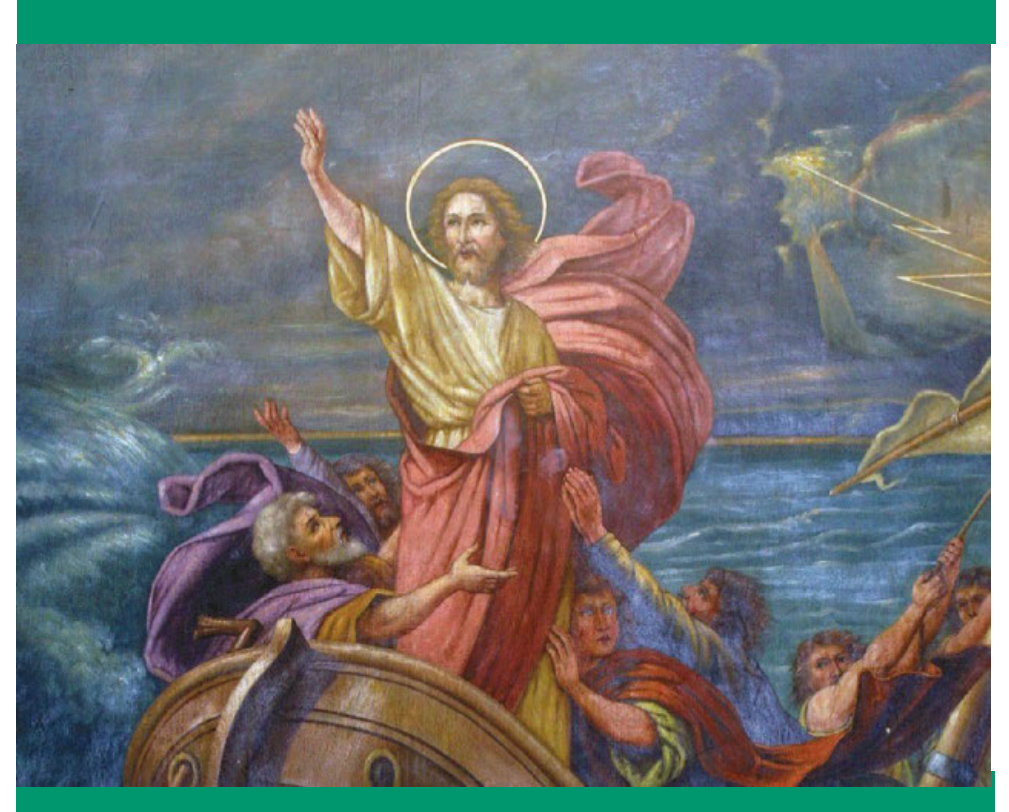
Twelfth Sunday in Ordinary Time