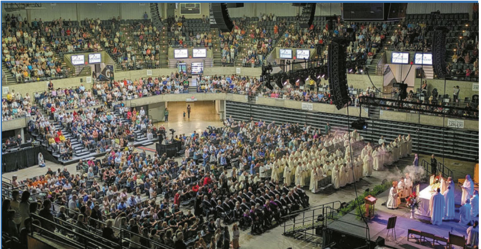
Over 2500 people were in attendance at the Mass held as part of the Answer Eucharistic Rally on June 7 at the La Crosse Center.