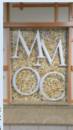
Hallway Mosaic behind MMOC Letters

Mosaic art is quite durable and functional; in fact it is considered the most long-lasting form of art in the world. Today, you will find mosaics used in several ways. They can be installed on the walls, floors, and ceilings of bathrooms and kitchens. High-traffic areas such as subways, swimming pools, and businesses are common locations. Mosaics are both decorative and functional and can be used to enhance both indoor and outdoor spaces. When installed properly, a mosaic can withstand exposure to sunlight, moisture, and temperature fluctuations – this is not the case with painted murals.