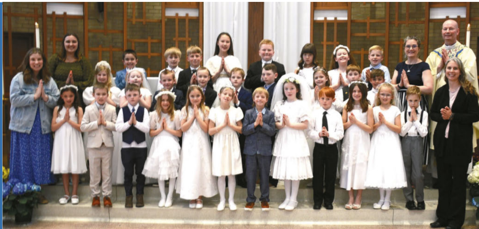
We give thanks to God for the Gift of Jesus in the Holy Eucharist and for our First Communicants (April 14, 2004)