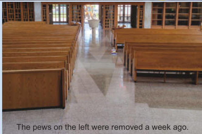
The pews on the left were removed a week ago.