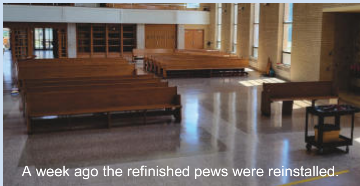
A week ago the refinished pews were reinstalled.