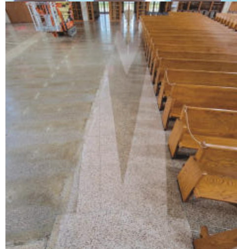
The refinished terrazzo looks much different!