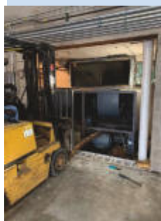
Dismantling the old air handling unit

Please remember to pray for our parish and the safety of the workers as we continue to Build Our Future Together.